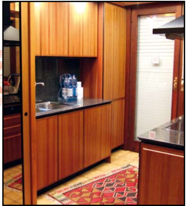
Bad feng shui, Cooker and sink facing each other